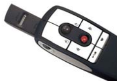
Receiver into the back