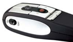
Power on /off switch